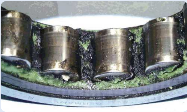
Lubricant degradation caused by electrical discharge currents