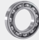
Steel ball guided cage