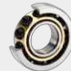
Bronze ball guided cage