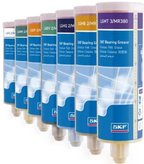
380 ml cartridges

Electro-mechanical single point automatic lubricators