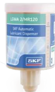
120 ml cartridge