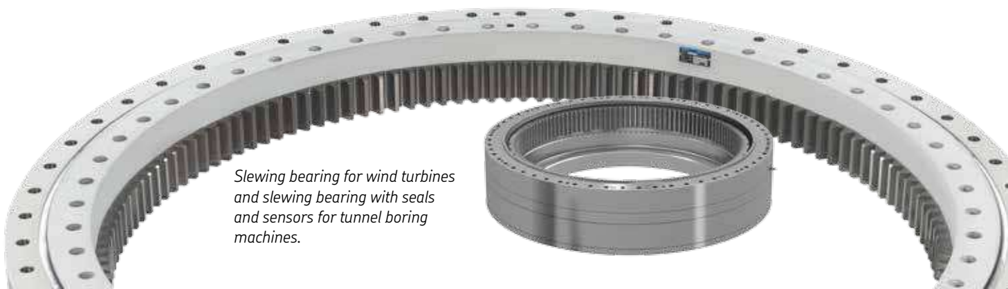
Slewing bearing for wind turbines and slewing bearing with seals and sensors for tunnel boring machines.