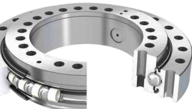
4-point contact slewing bearing for off-highway vehicles, pavers and road rollers