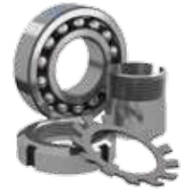
Tapered bore design