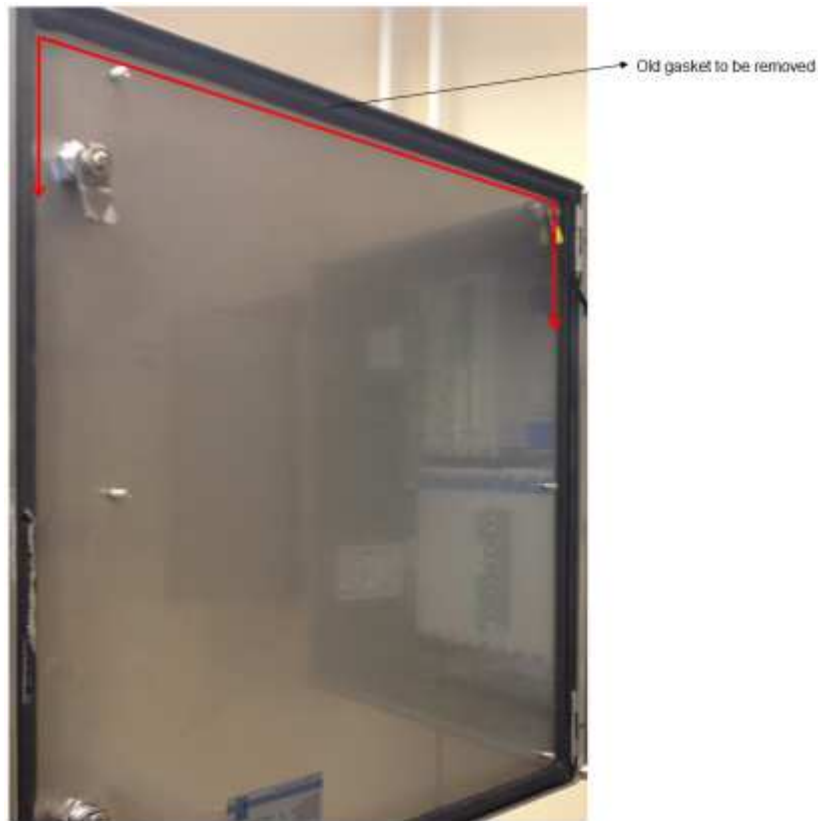
Figure 5-2: Old gasket to be removed