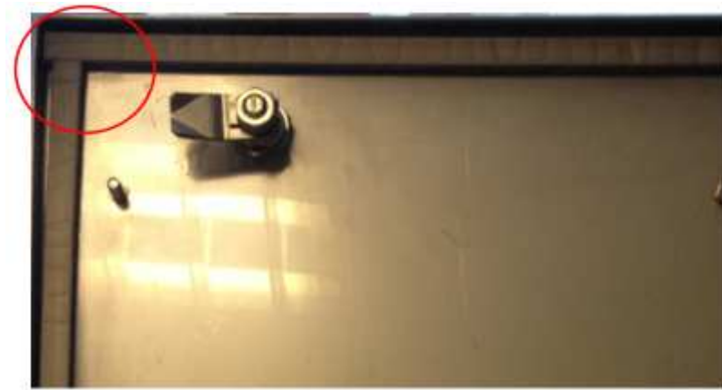
Figure 5-3: Example of homogenous gasket