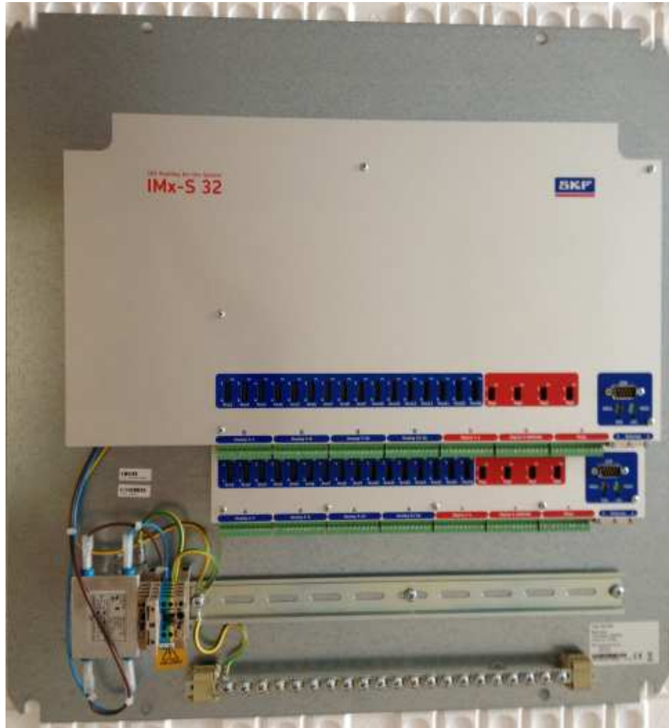
Figure 5-4: IMx-S 32 upgrade plate

Note: A space of at least 5 mm is needed between the cabinet wall and the IMx-S upgrade plate.