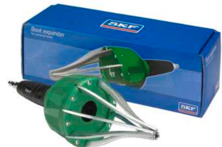
Εργαλείο διαστολής: VKN 402

Η φούσκα VKJP 01011 είναι κατασκευασμένη από υλικό μεγάλης ελαστικότητας και μπορεί να τοποθετηθεί εύκολα και γρήγορα με το ειδικό εργαλείο αέρος VKN 402, χωρίς την εξαγωγή του μπιλιοφόρου από τον άξονα.