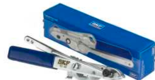
Εργαλείο σύσφιξης: VKN 400

Για την σύσφιξη των κολιέδων, προτείνουμε την χρήση του ειδικού εργαλείου VKN 400, μιας και η λανθασμένη σύσφιξη των κολιέδων σημαίνει μέχρι και την καταστροφή του μπιλιοφόρου!