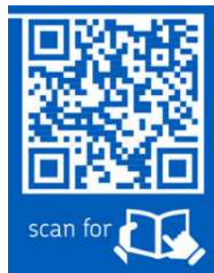
Product specific QR code on SKF boxes

The information is not only accessible quickly and easily but the technology allows us to update it as often as needed.