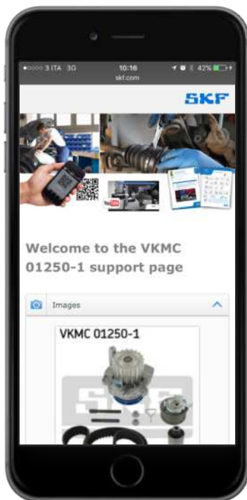
Detailed kit content

Further product information can be found in the SKF online catalogue available at vsm.skf.com or as a download via the SKF Automotive parts search app.