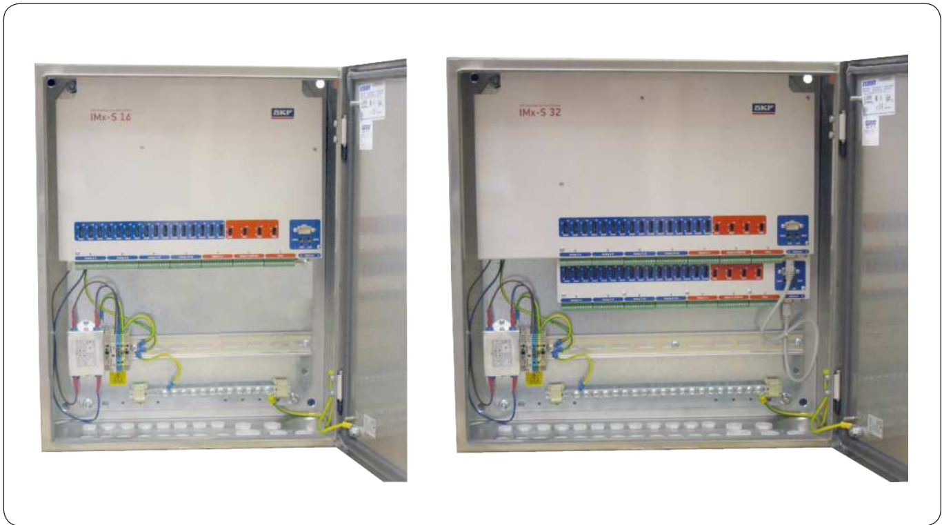
SKF Multilog On-line System IMx-S 16 (left) and the SKF Multilog On-line System IMx-S 32 (right) are available with optional stainless steel enclosure.